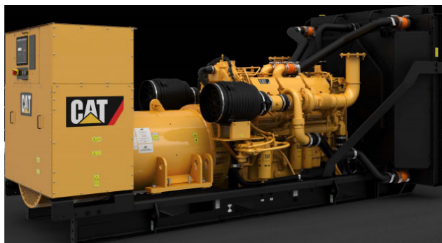
Image shown may not reflect actual configuration